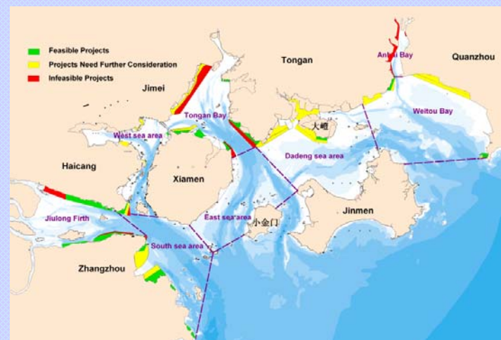
Fig.3 Design Proposals For The Results of Assessment